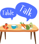
Table Talk... When during this past week did you invite someone to pray or come to Mass with you?

The Mission Ladies will be selling raffle tickets for their quilt raffle this fall. Look for them at Sacred Heart before Masses the weekend of July 4. You get a chance to win a beautiful quilt and at a minimum help local charities.