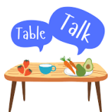
Table Talk... How will you love your neighbor, and yourself this week?

St. Bartholomew members —we are invited to a Community Picnic THIS Thursday, July 9. All of the churches in Villard are coming together for this fellowship. Meet at the Community Center by the firehall at 5:30pm. If you are able, please bring a dessert to share.